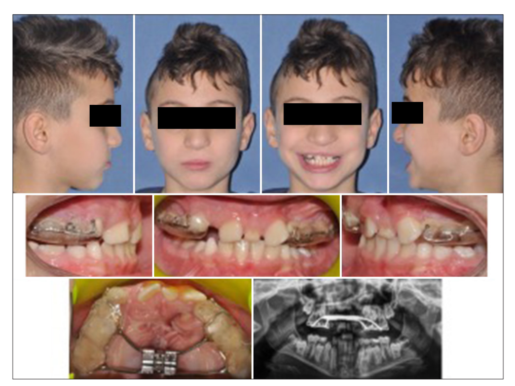
Figure 2: Intraoral photographs and panoramic X-ray after treatment (T1).