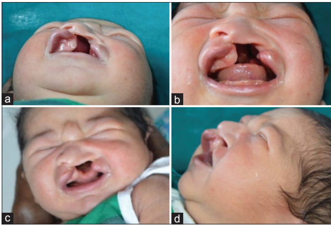
Figure 1: (a-d) Prenasoalveolar molding photos

After a thorough evaluation, nasoalveolar molding (NAM) therapy was planned for the patient. The parents were counseled properly about the procedure, duration, and prognosis of treatment, and their active involvement during the PNAM process was explained. On the initial visit, primary impression was made using a wax sheet dipped and softened in mild warm water, then primary cast was poured, and a special tray was fabricated using acrylic resin to take the secondary impression. On the first visit itself, lip taping was done using 3M™ Steri-Strip™. A base tape was placed and a hydrocolloid type bandage, was placed over the cheeks. It serves as a barrier between the retention tapes and the cheeks to minimize tissue irritation. Instructions were given to parents about lip taping and were advised to continue lip taping for 2 weeks [Figure 2a-g].