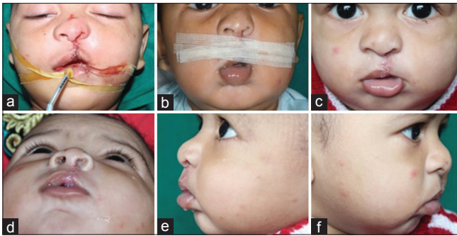
Figure 5: (a and b) After 5 months, lip surgery was performed, (c-f) on 3-week follow-up postlip surgery, there is reduction in bi-alar width and lengthening of columella after molding

frequent adjustments can be avoided which often lead to poor support of parents toward NAM therapy, also wherein alveolar and nasal molding are done at the same time. The rationale behind this was the acquired maternal estrogen before birth results in decrease in elasticity and increase in plasticity of cartilages. It has been assessed by Matsuo et al. that the temporary plasticity of nasal cartilage is believed to be caused by high levels of maternal hyaluronic acid, a component of the proteoglycan intercellular matrix, which is found circulating in the infant for several weeks after birth. [2,4] Advantages of NAM are the ability to guide the alveolar segments to a more normal position prior to surgery and reduction of the cleft gap facilitates the primary gingivoperiosteal closure of cleft defect because there is a greater probability that a complete osseous bridge formation will happen when cleft width is reduced. The combined action of NAM plate and nonsurgical lip approximation with lip taping results in a predictable correction of the nasal, alveolar, and soft-tissue deformities. As a result under surgical repair, the lip and nose heal under minimal tension with no or minimal scar formation.