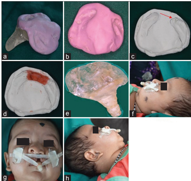
Figure 3: (a) Heavy-bodied silicone material impression with tray, (b) impression showing cleft size, (c) cast poured showing cleft size of 13 mm, (d) cleft area blocked out with wax, (e) molding appliance fabricated with self-cure hard clear acrylic resin, (f-h) Lip taping and nasoalveolar molding plate without nasal stent given on the same day

resembles the nostril on the unaffected side and the infant weighed 9 kg [Figure 4a-g].