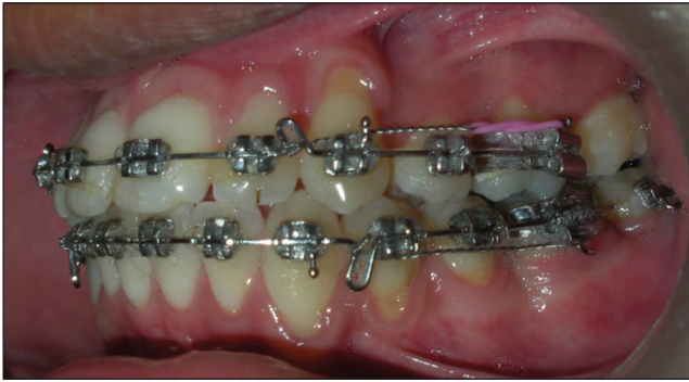
Figure 3: Intraoral picture with modified tiebacks

Unitek, Monrovia, CA 91016) through an elastomeric module (3M Unitek, Monrovia, CA 91016) and wind it onto itself to form a smooth coil extending from the elastomeric module to a distance 1.5-2 mm short of the archwire hook [Figure 2] and hence that when the elastomeric module is