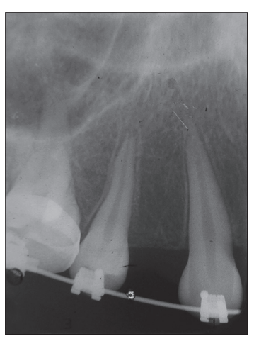
Figure 1: Preoperative intra oral peri-apical radiograph