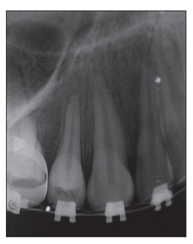
Figure 3: Six months postretraction intra oral peri-apical radiograph

selected as a control site. The space present on both the sites was recorded for both the groups at baseline as well as at an interval of 1 month.