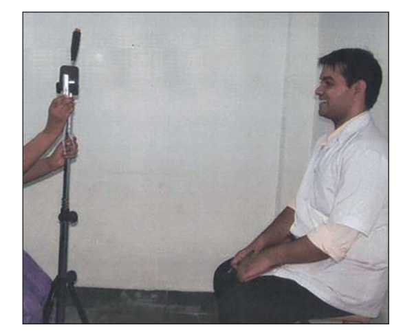
Figure 2: Photographic setup