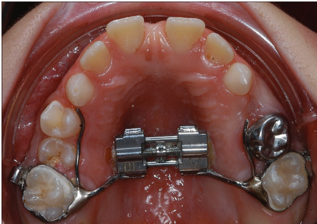
Figure 1. Tooth-borne hyrax-type expansion appliance used.

mm. Subsequent scans were taken with a 1 mm slice thickness, 1 mm interval, at 100 mA, with a 13.7 cm field of view, a 512 × 512 matrix, and a 0° gantry angle, and at 120 KV.