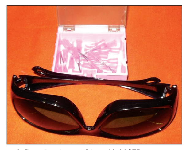
Figure 3: Protection glass and Disposable LASER tips