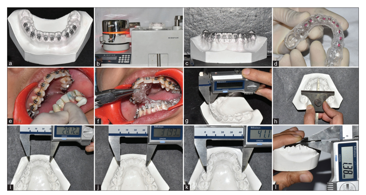
Figure 2: (a) Bracket positioning, (b) pressure molding of biostar sheet, (c and d) retrieval of brackets, (e) etching procedure, (f) tray removal, (g) measurement of Little's irregularity score, (h) arch length, (i) intercanine archwidth, (j) interpremolar archwidth, (k) Intermolar arch width, and (l) curve of Spee.