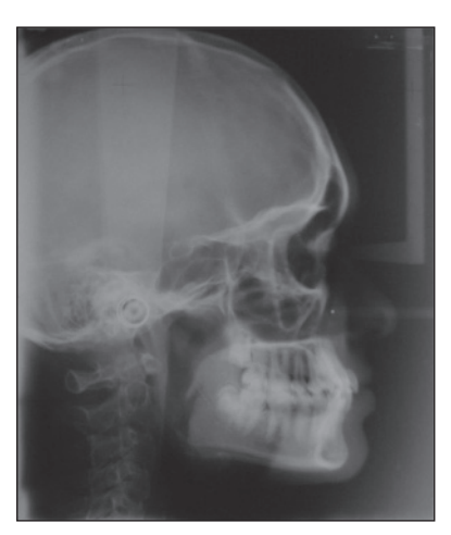
Figure 3: Pre-treatment lateral cephalogram

relationships, moderately crowded mandibular incisors, mild or no crowding in the maxillary arch, acceptable soft tissue profile, minimal to moderate growth potential, and missing or peg-shaped maxillary lateral incisor.