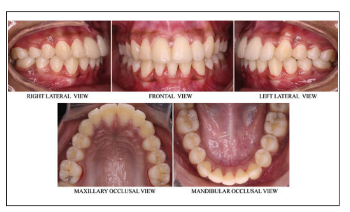
Figure 8: Post-treatment intra oral photographs