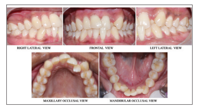
Figure 2: Pre-treatment intra-oral photographs

A 19-year-old female presented with a chief complaint of irregularly placed teeth in the upper and lower front tooth region. Clinical examination revealed competent lips and a straight profile [Figure 1]. On smiling, she displayed 100% of her incisors. There was unilateral anterior cross bite in relation to 21 and 31 and 22 and 32 [Figure 2]. The molar and canine relationships were class I. Model analysis revealed crowding of 5 mm in the upper arch and 7 mm in the lower arch. The patient had a 30% overbite and 1 mm overjet, with the lower midline shifted 2 mm to the right. Good oral hygiene was evident although slight gingival recession was found in the areas of the lower incisors and cuspid. Cephalometric analysis was done using Dolphin Imaging and Management solutions (Patterson dental supply, version 11.0, United States), which revealed the presence of skeletal class III pattern [Figure 3]. Pre treatment orthopantomogram displayed sufficient amount of alveolar bone and no signs of bone loss [Figure 4]. Model analysis showed