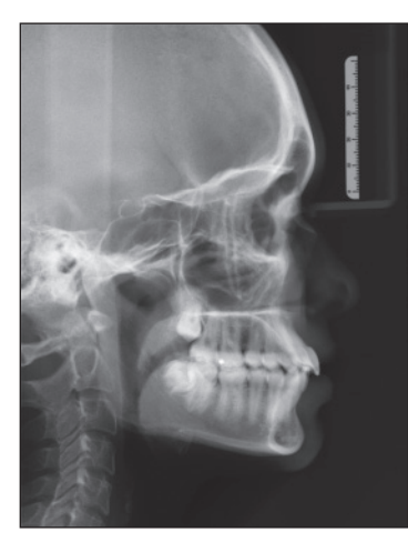
Figure 9: Post-treatment lateral cephalogram

similar case in which mandibular incisor extraction was done in order to maintain the acceptable facial profile and to compromise for a skeletal class III tendency and showed stable results. Prakash et al. <sup>[10]</sup> published a similar case treated with mandibular incisor extraction for the correction of lower anterior crowding. Since the extractions of premolars were avoided, the maintenance of posterior occlusion was not a concern and it also reduces the treatment time.