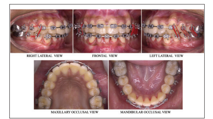
Figure 6: Settling of occlusion photographs