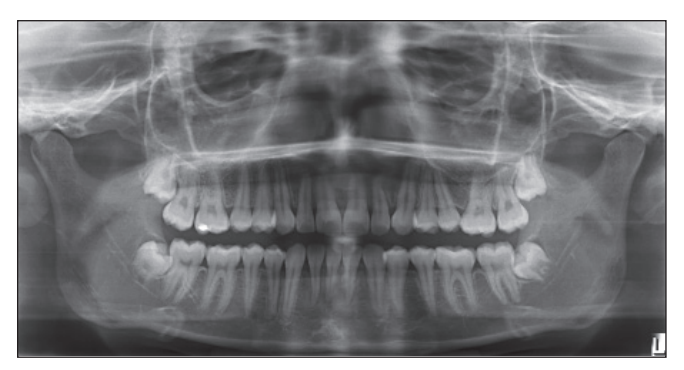
Figure 10 : Post-treatment OPG