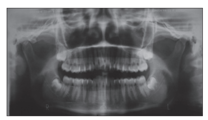
Figure 4: Pre-treatment OPG