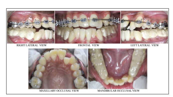
Figure 5: Mid-treatment photographs

Facial photographs showed only little changes in the facial profile and a very good improvement in the smile of the patient [Figure 7]. The post-treatment results showed a good occlusion between the upper and lower arches and a good inter-cuspation of the posterior teeth [Figure 8]. There was a pretty good alignment of the upper and lower arches. An esthetically acceptable smile arc was achieved after the correction of the maxillary anterior crossbite. Pre and post treatment cephalometric values are shown in [Table 1].