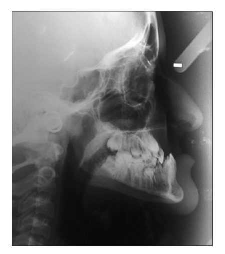
Figure 3: Pretreatment cephalogram radiograph