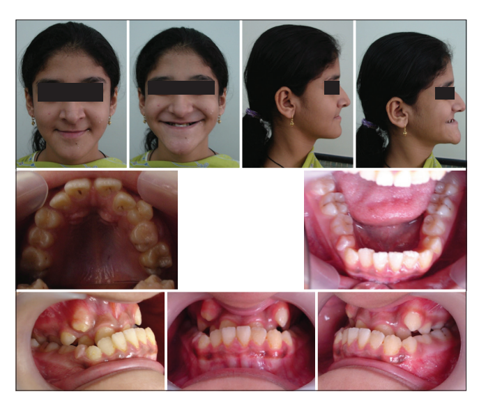
Figure 1: Pretreatment extraoral and intraoral pictures