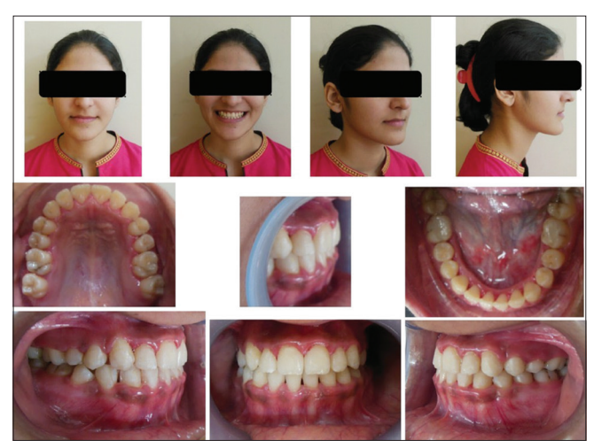
Figure 5: Posttreatment extra- and intra-oral pictures

seeking orthodontic treatment at a private orthodontic clinic.