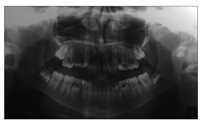
Figure 2: Pretreatment orthopantomogram radiograph

seeking orthodontic treatment at a private orthodontic clinic.