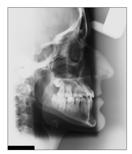
Figure 6: Posttreatment cephalogram radiograph