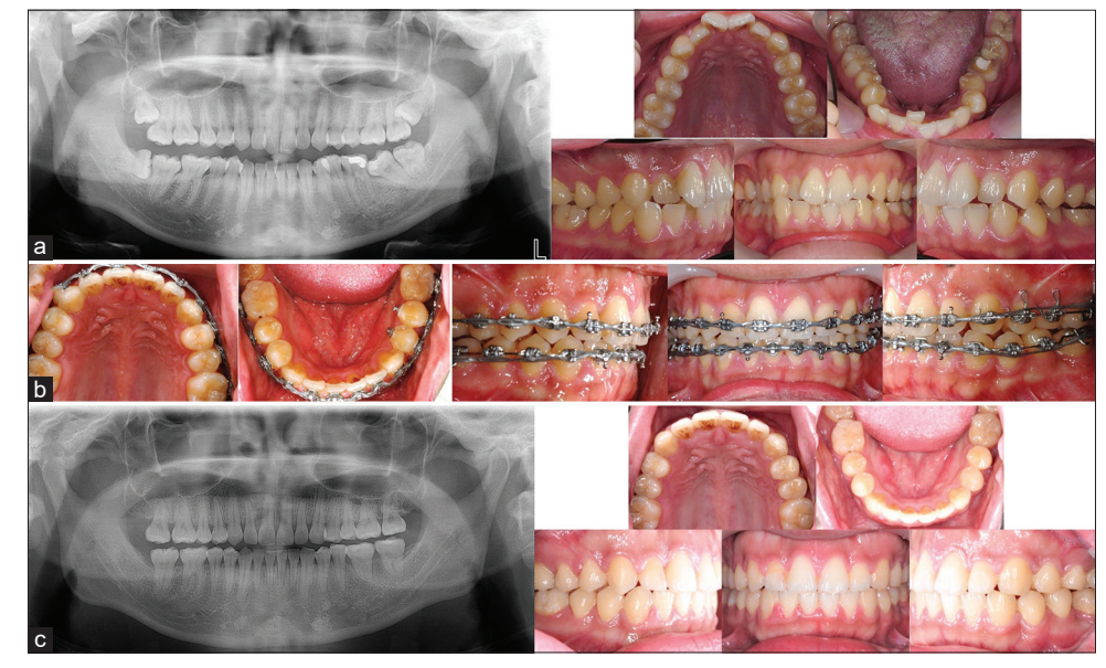
Figure 1: Case 1: (a) Initial records; (b) Mid-treatment records, metal brackets (Ormco, CA, USA) with 0.018-in slots for the anterior teeth and 0.022-in slots for the posterior teeth. The initial wires were 0.016-in NiTi and 0.016 \times 0.022-in NiTi, the working wire was 0.016 \times 0.022- in SS, and the finishing wire was 0.017 \times 0.025-in TMA; (c) Post-treatment records.

A 35-year-old female patient presented to our clinic with dental crowding and crossbite. She had skeletal Class III