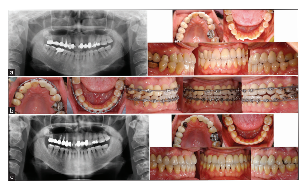
Figure 2: Case 2: (a) Initial records; (b) Mid-treatment records, metal brackets (Ormco, CA, USA) with 0.018-in slots for the anterior teeth and 0.022-in slots for the posterior teeth. The initial wires were 0.016-in NiTi and 0.016 \times 0.022-in NiTi, the working wire was 0.016 \times 0.022- in SS, and the finishing wire was 0.017 \times 0.025- in TMA; (c) Post-treatment records.