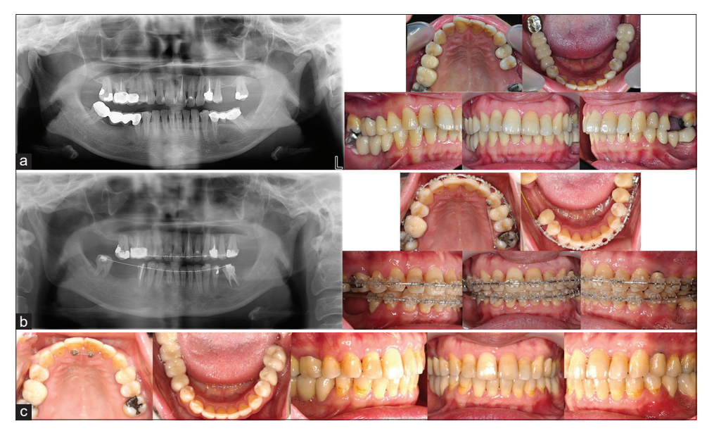
Figure 3: Case 3: (a) Initial records; (b) Mid-treatment records, clear brackets (Tomy, Tokyo, Japan) with 0.018-in slots for the anterior teeth and 0.022-in slots for the posterior teeth. The initial wires were 0.016-in NiTi and 0.016 \times 0.022-in NiTi, the working wire was 0.016 \times 0.022- in SS, and the finishing wire was 0.017 \times 0.025-in TMA; (c) Post-treatment records.

of the buccal or lingual alveolar bone to collapse, thereby impeding the posterior teeth from moving forward across it or causing them to move the surrounding bone with them. Although the teeth can be forcibly pulled toward the shrinking ridge, this may result in the loss of periodontal attachment, root resorption, increased tooth mobility, and even the loss of pulp vitality.<sup>[13]</sup> Consequently, tooth movement toward a fresh extraction socket is faster and more achievable because the