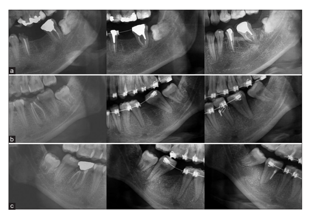
Figure 6: (a) No spontaneous eruption of the horizontally impacted third molar after second molar protraction. (b and c) Spontaneous eruption of the vertically impacted third molar.