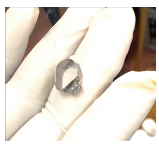
Figure 4: Retreived molar band.

Supine position of patient during orthodontic procedures, small size of objects, and salivary field of work have been attributed as factors that predispose orthodontic materials for accidental ingestion.<sup>[5]</sup> About 92.5% of swallowed foreign bodies have been shown to enter the GI tract while 7.5% are aspirated into the tracheobronchial system. [6] Cleft lip/palate patients with compromised velopharyngeal competency and patients with reduced laryngeal closure are at risk of aspiration compared to others.<sup>[7]</sup> Ingested foreign bodies have a spectrum of sequelae. Majority of them that have passed the Duodenal sweep exit the GI tract asymptomatically within 3 days of ingestion. [8,9] However obstruction or impaction in cases of objects with projections as in this instance of a hook in the band can result in dysphagia, abdominal pain, abdominal distention, sepsis, and perforation which can be fatal.[4] Early location and an immediate attempt to remove the object are the preferred protocol. In our case, immediate location and