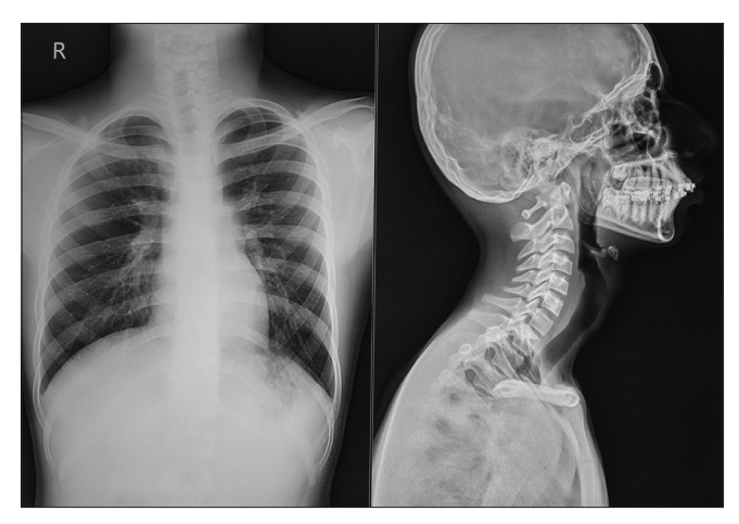
Figure 1: Posteroanterior view and lateral view of chest.

was taken which revealed the band as a hyper dense field in the stomach [Figure 2]. The patient was taken for a gastroenterological consultation where an endoscopy was advised. The band was located and retrieved by endoscopy without complication [Figures 3 and 4] [Video 1].