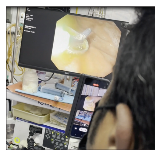
Video 1: Endoscopy video.