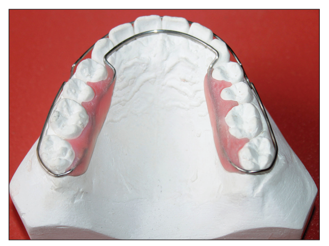
Figure 4: Acrylic is then added on the lingual side from premolar to the molars