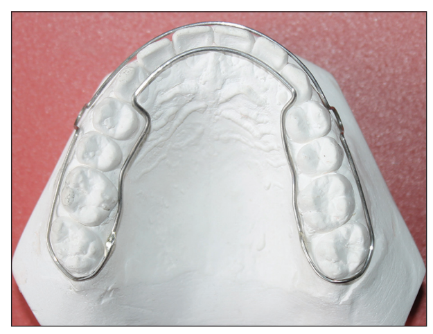
Figure 3: The cut ends are overlapped and soldered

It has a minimal acrylic component which rests only on teeth and tissue to take the support of tissues for its retention; therefore, it is less bulky, has low food accumulation, and is easy to clean. It does not have a crossover wire thus avoids opening of extraction space and opening of bite. The patient's speech and taste are not compromised. The U-loops cause no gingival impingement and also they are less visible, hence more comfortable and esthetic.