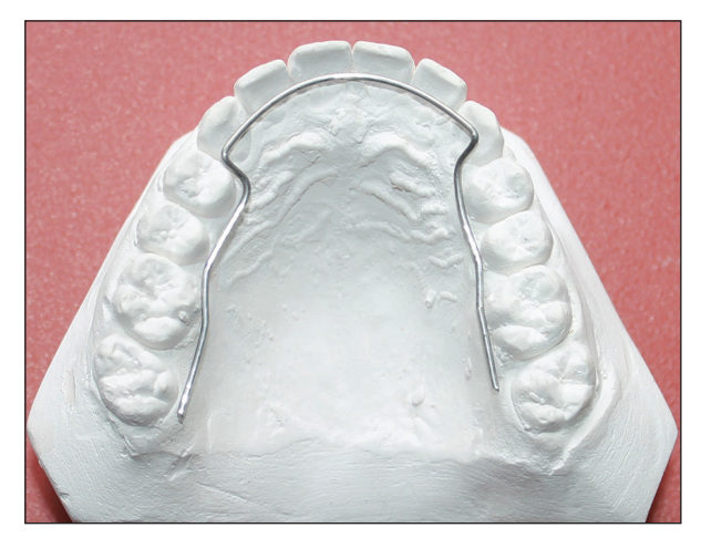
Figure 2: A lingual adaptive wire is made of 19-gauge wire touching the lingual surface of the teeth