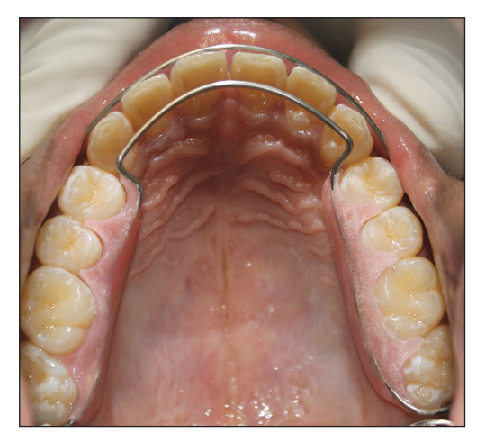
Figure 5: Finished appliance