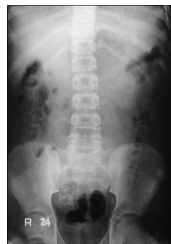
Figure 4: Anteroposterior abdominal radiograph showing no evidence of the anchorage screw in the abdominal cavity