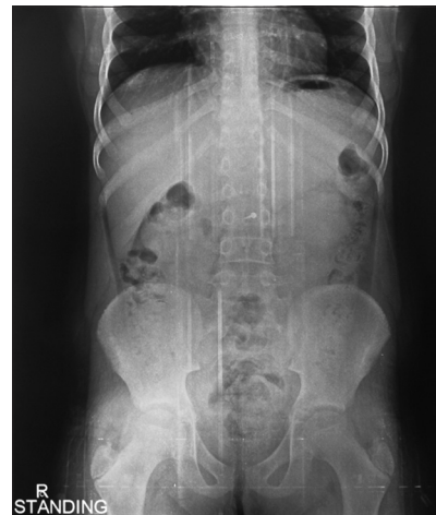
Figure 3: Anteroposterior abdominal radiograph showing the presence of the anchorage screw in the abdominal cavity