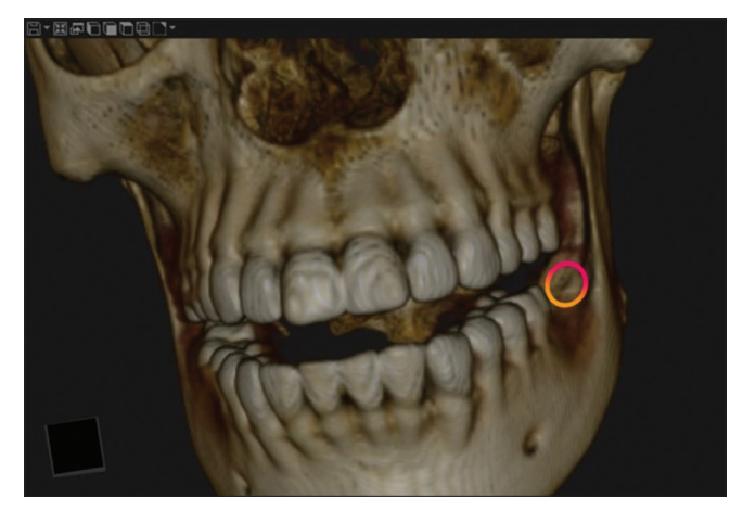
Figure 3: 3D cone-beam computed tomography image showing the presence of RMF (orange circle). RMF: Retromolar formamen.

Subsequently, the coronal view of the samples that exhibited the presence of RMF was singled out. For the marking of the RMF, the nerve canal marking tool was employed, as shown in [Figure 5]. Following this, the chosen CBCT images