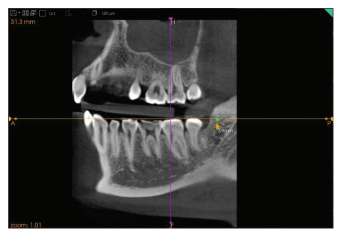
Figure 6: Linear distance of retromolar foramen from the occlusal plane.

[Table 2] provides an overview of the general occurrence of the RMF as well as a comparison of its prevalence across genders. No notable significant variations were observed in the RMF prevalence between the two sexes. On the whole, out of the 136 samples examined, the presence of RMF was identified in 39% (53 samples) of the total. This substantial prevalence underscores the significance of regular assessment during clinical procedures such as implant placement. [Table 3] delineates the comparison of RMF prevalence