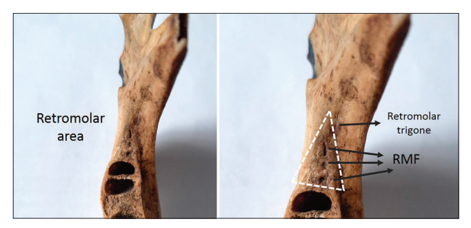
Figure 2: Anatomy of retromolar area showing the retromolar trigone and retromolar foramen (black arrows). RMF: Retromolar formamen

Thus, this study aimed to evaluate the anatomic considerations during the placement of retromolar miniplates and study the characteristics of the RMF using CBCT in a South Asian population sample.