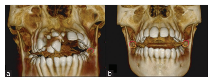
Figure 4: Evaluation of 3D cone-beam computed tomography image showing (a) unilateral and (b) bilateral presence of RMF. (RMF: Retromolar formamen)