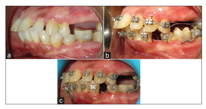
Figure 3: (a) Pretrearment, (b) 2.5 months after placement of modified lingual arch, (c) posttreatment