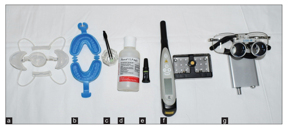
Figure 1: Study Armamentarium (a) Lip and cheek retractor (b) Application trays for fluoride gel (c) Dappen dish with brush applicator sticks for fluoride varnish (d) Fluocal fluoride gel (e) Fluor Protector fluoride varnish (f) DIAGNOdent pen 2190 with autoclavable tips (g) Magnifying surgical loupe.

While in, fluoride varnish half (B) - topical fluoride varnish was applied to the other remaining half of