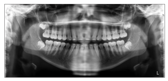
Figure 7: Post-treatment panoramic radiograph.