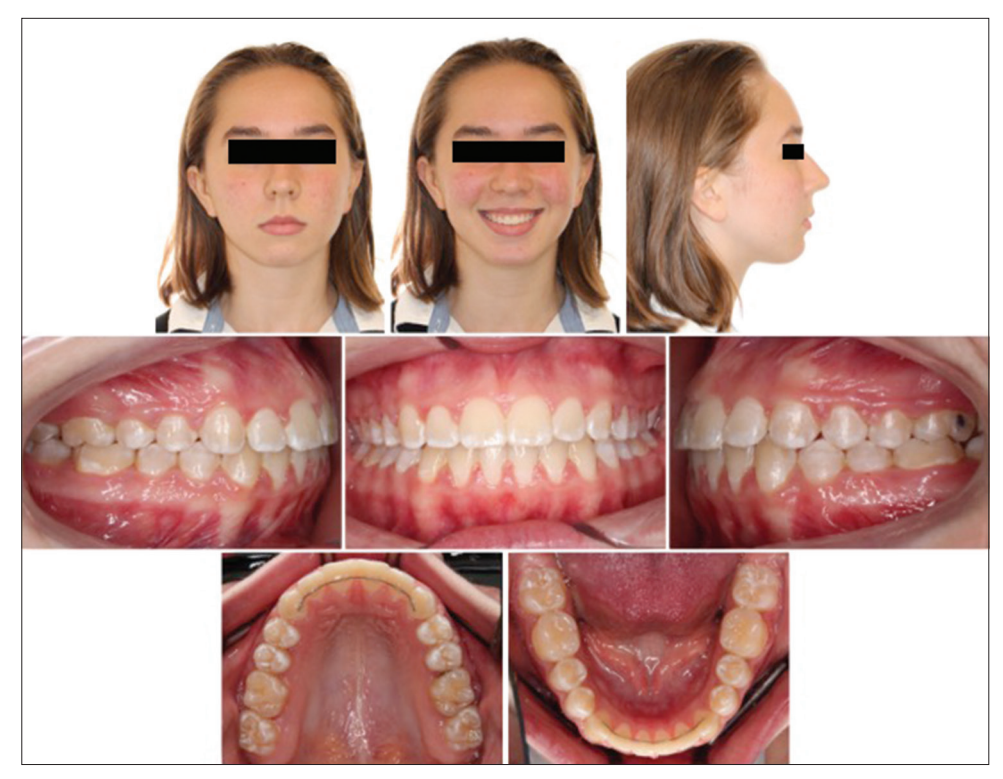
Figure 5: Post-treatment facial and intraoral photographs.