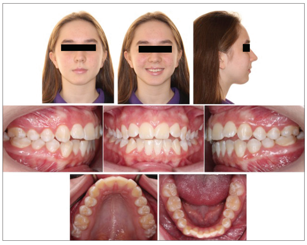
Figure 2: Pre-treatment facial and intraoral photographs.

The patient had good incisor show on smile and at rest. The patient needed improvement of facial convexity and overjet along with improvement or maintenance of the mandibular plane angle. Therefore, to achieve these treatment goals, the selected treatment plan for correction of the anterior open