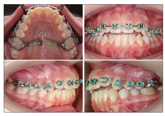
Figure 4: Progress intraoral photographs.