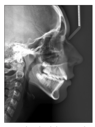
Figure 3: Pre-treatment lateral cephalometric radiograph.

The final result showed that the patient had a satisfactory and pleasing esthetic outcome, with resolution of her chief complaint [Figure 5]. The patient has an improved soft tissue profile with improvement in chin projection along with maintenance of the mandibular plane angle and FMA during growth. The upper molar intrusion allowed for slight counterclockwise rotation of the mandible, thus advancing pogonion and advancing the lower incisor position to correct the overjet without changes to the mandibular plane angle [Figure 6]. The open bite was closed with 1.5 mm upper molar intrusion and 1.2 mm of upper incisor extrusion, which helped to achieve a good incisor show for the patient with 2 mm of gingival display on smile. The final result showed good alignment, with good seating and functional occlusion. The final panoramic X-ray [Figure 7] showed good root parallelism, without significant root shortening or development of other pathologies. The patient reports no development of signs or symptoms of TMJ disorder.