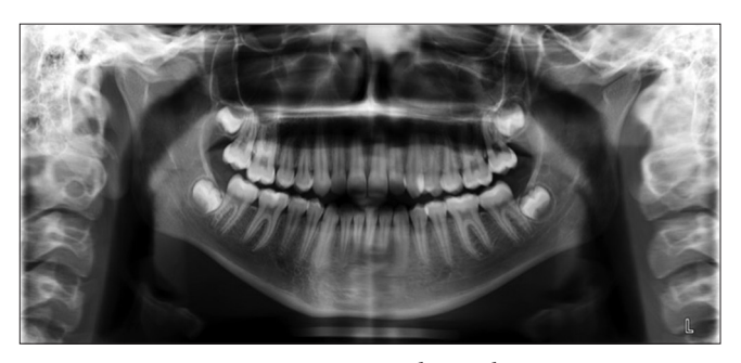
Figure 1: Pre-treatment panoramic radiograph.

Clinical examination [Figure 2] showed a convex soft tissue facial profile due to a retrognathic mandible. The patient had 100% incisor show on smile and 2 mm incisor show at rest. The maxillary dental midline was coincident with facial midline and mandibular midline was deviated 0.5 mm to