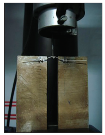
Figure 1: Jigs with wire in place - start of loading

The lower member was then attached to the stationary lower clamp and the upper member was attached to the load cell, with a full-scale range of 0-10 kg, of the cross head