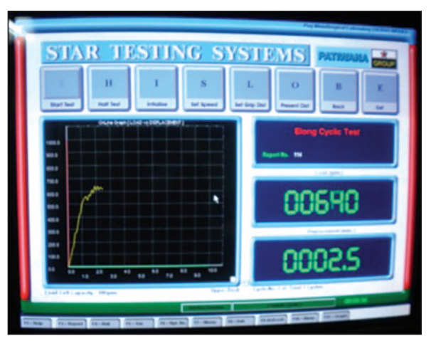
Figure 2: Screenshot of computerized plotting of the load – deflection curve – start of loading

production. After 0.5-1 mm of deflection, the wires began to "recover" and produce average force levels of the plateau. Group 4 showed a steep raise in force production that ranged from 3.5 to 1 mm on unloading. This result is in agreement with the result obtained by a similar study. The reason attributed to this result is that forces generated depend on the severity of the deformation, the crystalline structure and the transition temperature range (TTR). It has been reported that the TTR could be shifted to a higher temperature in an alloy that forms stress induced martensite (SIM) during its activation. This would thus require a higher temperature than expected to transform the SIM into its austenitic form. In this study, the temperature was kept constant and above the A<sub>r</sub> which explains the nature of the unloading curve.