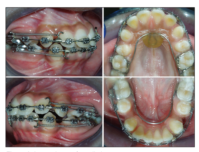
Figure 2: Intraoral view of installed jig

more apically. This type of jig can be made and readjusted quickly at chair side with minimum effort.