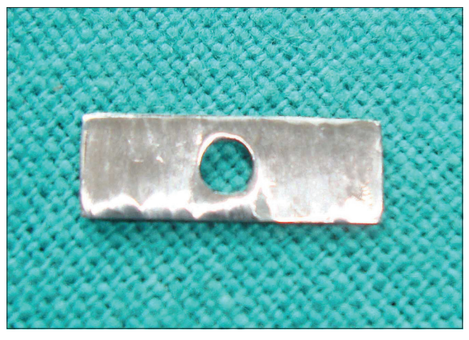
Figure 1: A hole of 3 mm diameter drilled into the centre of the band