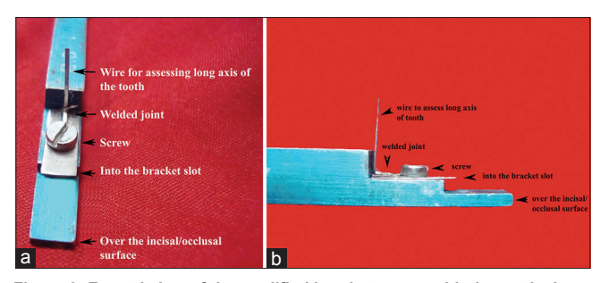
Figure 3: Frontal view of the modified bracket gauge with the vertical arm welded on the opposite side of the end of the measuring side of the gauge (a). Lateral view of the modified bracket gauge with the vertical arm welded on the opposite side of the end of the measuring side of the gauge (b)