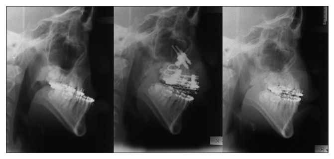
Figure 6: Series of patients treated for Le Fort I midface advancement with internal distraction: Lateral cephalograms before, during, and after internal midface distraction

Distraction in the cleft patient can be achieved with external or internal distraction devices. Depending on the surgeon's preference and clinical presentation of deformity, either approach may be used to achieve the desired results. Internal distraction devices are more acceptable to the patient; however, they offer some clinical limitations. The external devices can be adjusted to change the vector of skeletal correction during the active phase of distraction while the internal device cannot be adjusted in this way. After the Le Fort I osteotomy and a latency period of 5-6 days, the distraction device is activated at the rate of 1 mm/day until the desired advancement is achieved. Interarch elastics may be used during the active phase of distraction osteogenesis to guide the maxilla to its optimal position and the teeth to optimal occlusion. On completion of the advancement, there is an 8-week period of bone consolidation during which time the distraction devices serve as skeletal fixation appliances. Following this period of bone healing, the distraction devices are removed, and postdistraction orthodontics begins. The objective of postdistraction orthodontics is to retain the position of the advanced midfacial skeleton and to fine tune the occlusion.