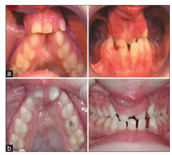
Figure 4: Occlusal (a) and frontal (b) views of a patient with bilateral cleft lip and palate who underwent rapid maxillary expansion with a bonded acrylic fan expander. Following transverse expansion, patient had bilateral alveolar bone grafts and premaxillary repositioning

Lateral cephalometric growth studies have shown that the maxilla in treated patients with cleft lip and palate show