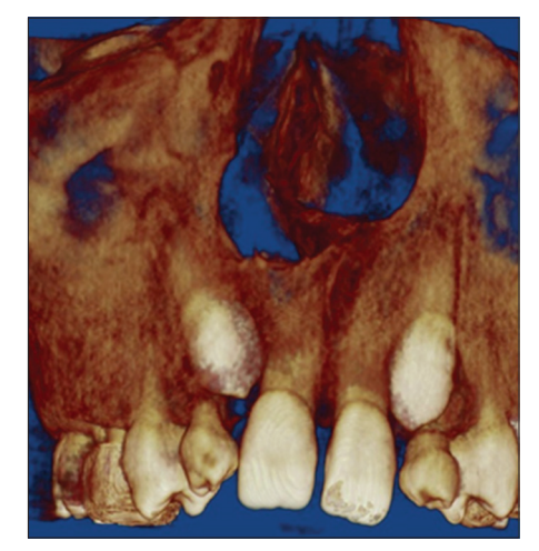
Figure 2: Sectional cone-beam computed tomography of a patient who underwent nasoalveolar molding and gingivoperiosteoplasty surgery to repair the alveolus at the time of primary lip closure. Note good bone formation on the right former cleft side. This patient did not need secondary alveolar bone graft surgery

Another important component of care for a patient during this time period includes routine follow-up with